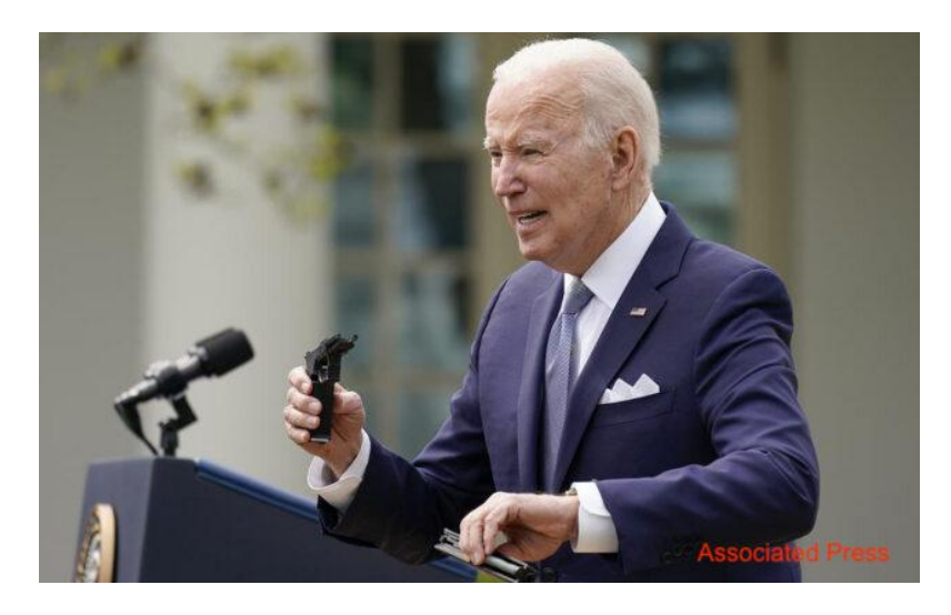
Why You Should Care About the whole "Ghost Gun" issue and the ATF Final Ruling

This has been a very eventful fortnight leading into the holiday weekend. As many families geared up to celebrate Passover, observed the Holy week, or prepared to enjoy a few days off in the spring, the anti-Liberty forces were scrambling to find new and exciting ways to restrict law abiding citizens. FOAC-ILLEA was also busy doing what it does; educating and fighting for the rights and Liberties of all Pennsylvanians.